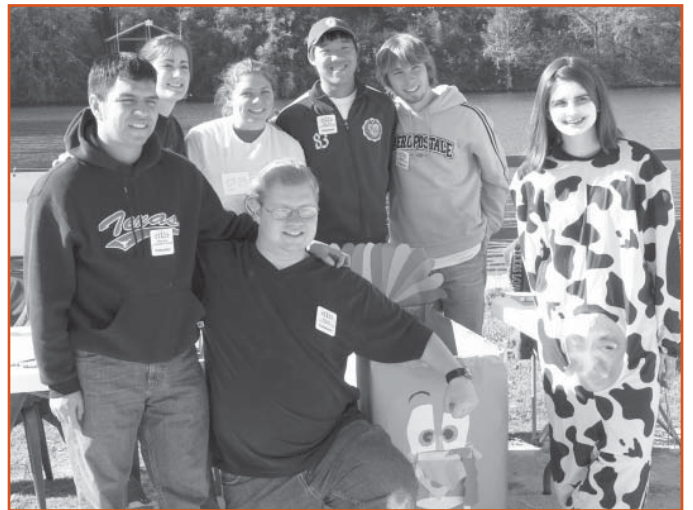
2007 Kid Fish volunteers