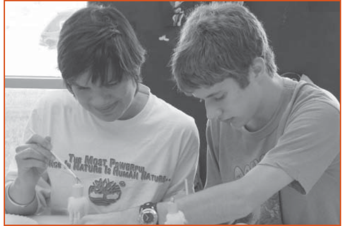
St. Andrews helps clients paint Christmas ornaments

We look forward to meeting and working with you!